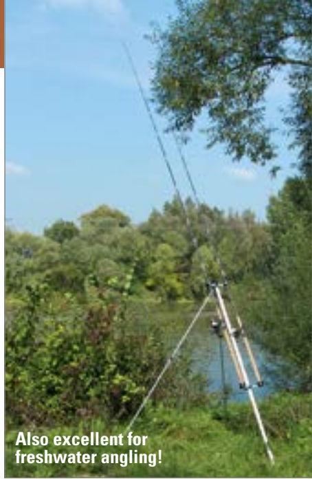
Also excellent for freshwater angling!