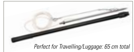
Perfect for Travelling/Luggage: 65 cm total

Large-fish Harpoon (Telescopic) Special equipment for large fish in Norway & Co. The headpiece of the harpoon is thrust into or through the hooked fish with a taught rope. Then the hand piece is pulled back with the metal piece – and the fish is pulled in by hand with the rope. (This is necessary because large fish such as Halibut, Cod, etc. cannot be handled with a gaff. The harpoon system is a much better solution.) Harpoon with rope, sturdy telescopic rod and adapter. Length total all-in-all: 145 cm. Special feature: compact transport size (approx. 65 cm) – great for traveling. Item-No. 4487 180