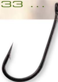
D-RIG BOILIE HOOK