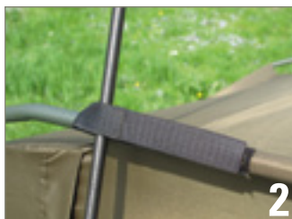
Velcro band for attaching rods