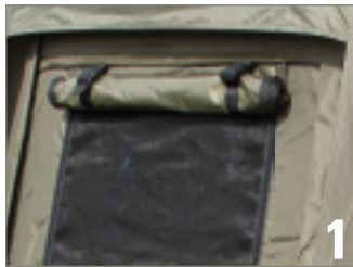
Door: Net + See-through PVC