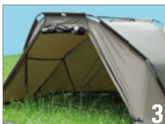
Tent front can be completely rolled up