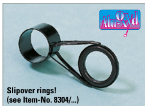
Slipover rings! (see Item-No. 8304/...)